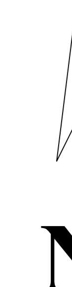
Schita cu dispunerea sectorului