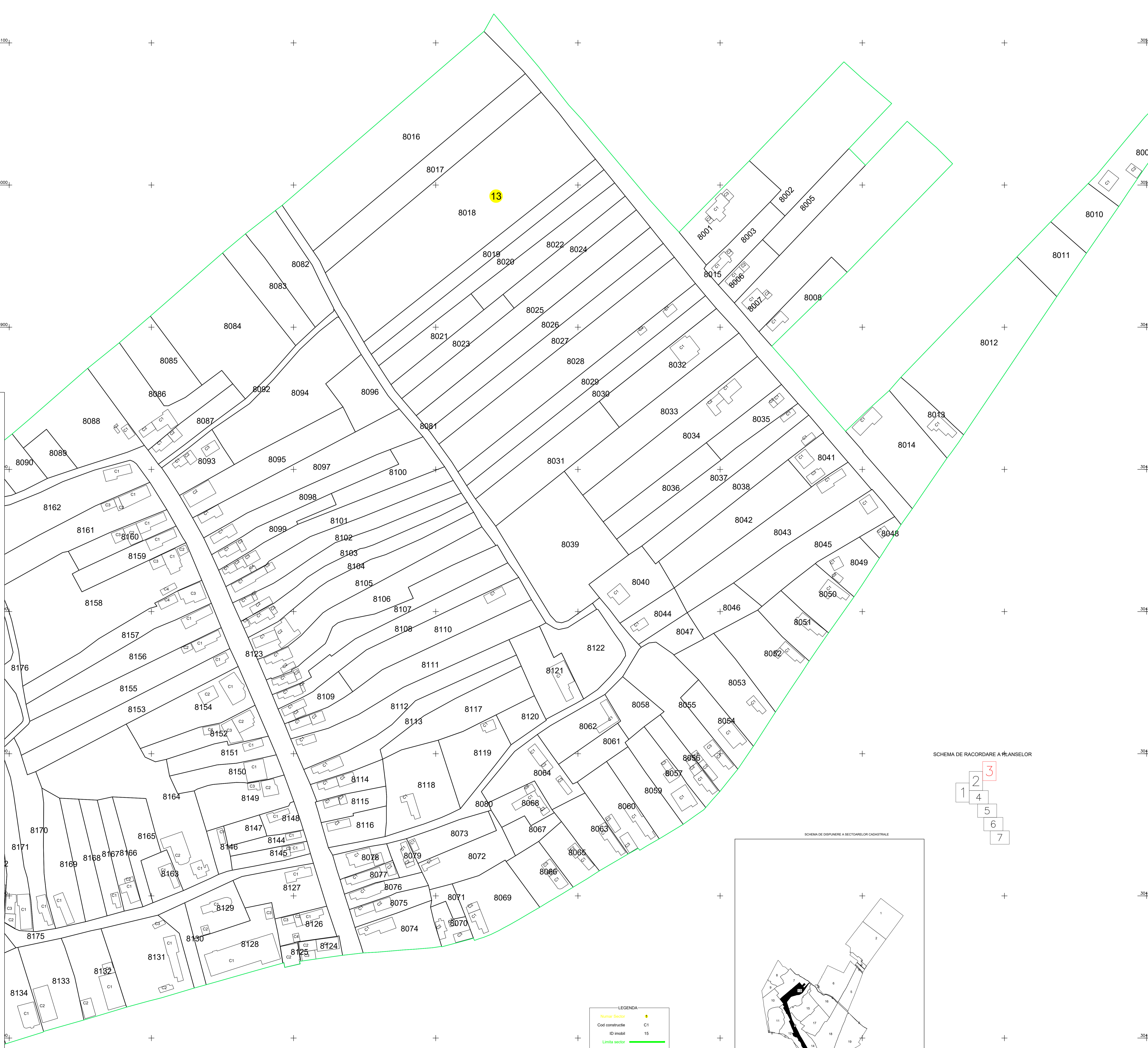
SCHEMA DE RACORDARE A HANSELOR