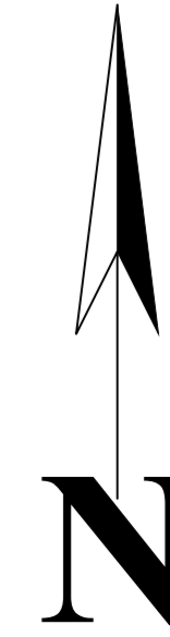
Schita cu dispunerea sectorului