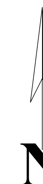
Schita cu dispunerea sectorului